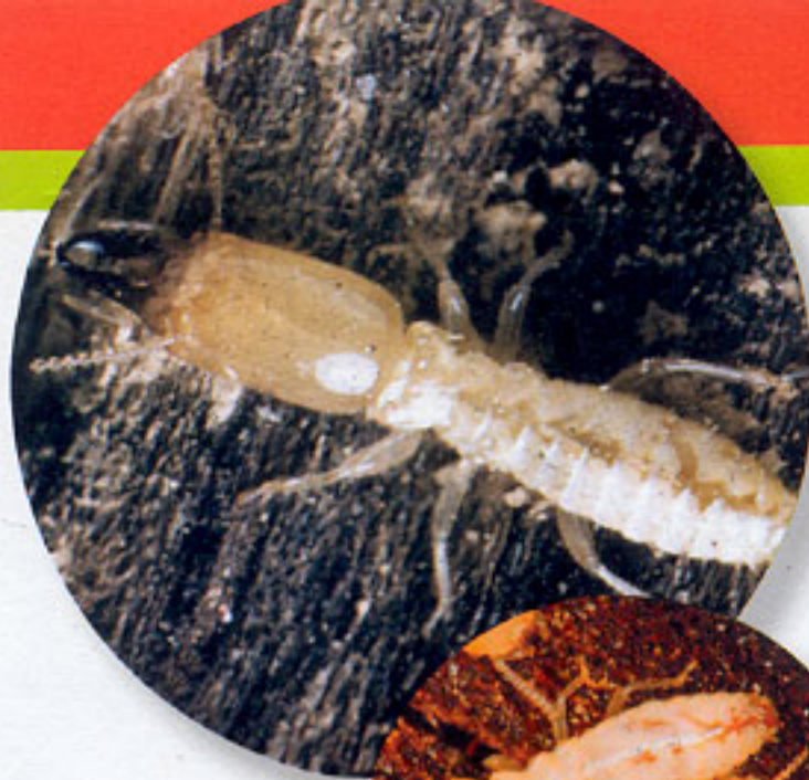
Left: Subterranean Termite Soldier