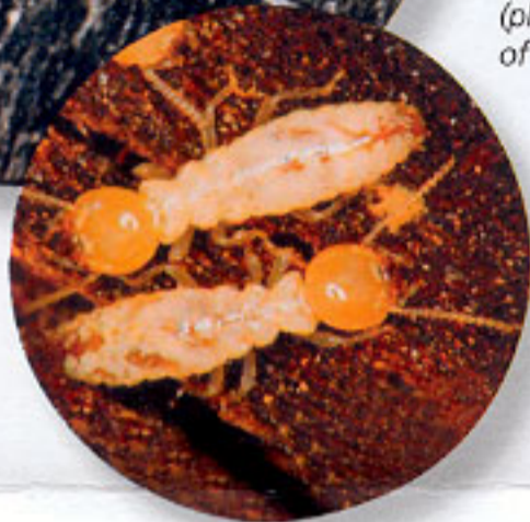
Below Left: Subterranean Termite Worker