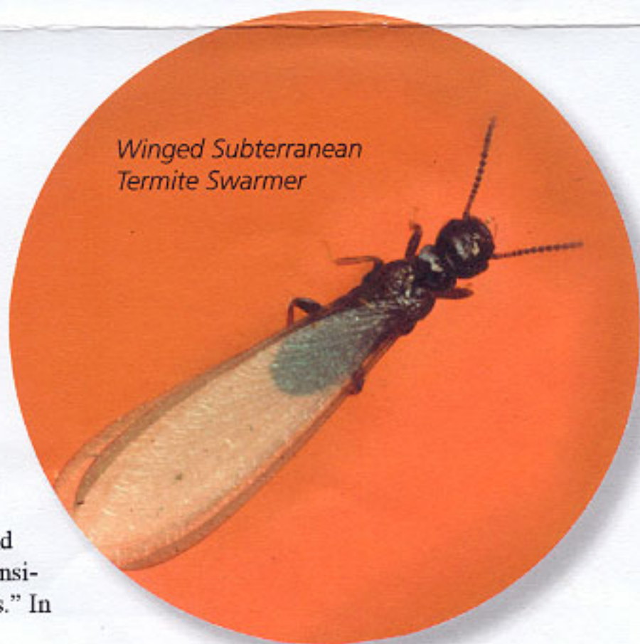
Winged Subterranean Termite Swarmer

Workers are small white insects. They are blind and very sensitive to heat, cold and dry air. This sensitivity is why they build shelter tubes or "mud tubes." In