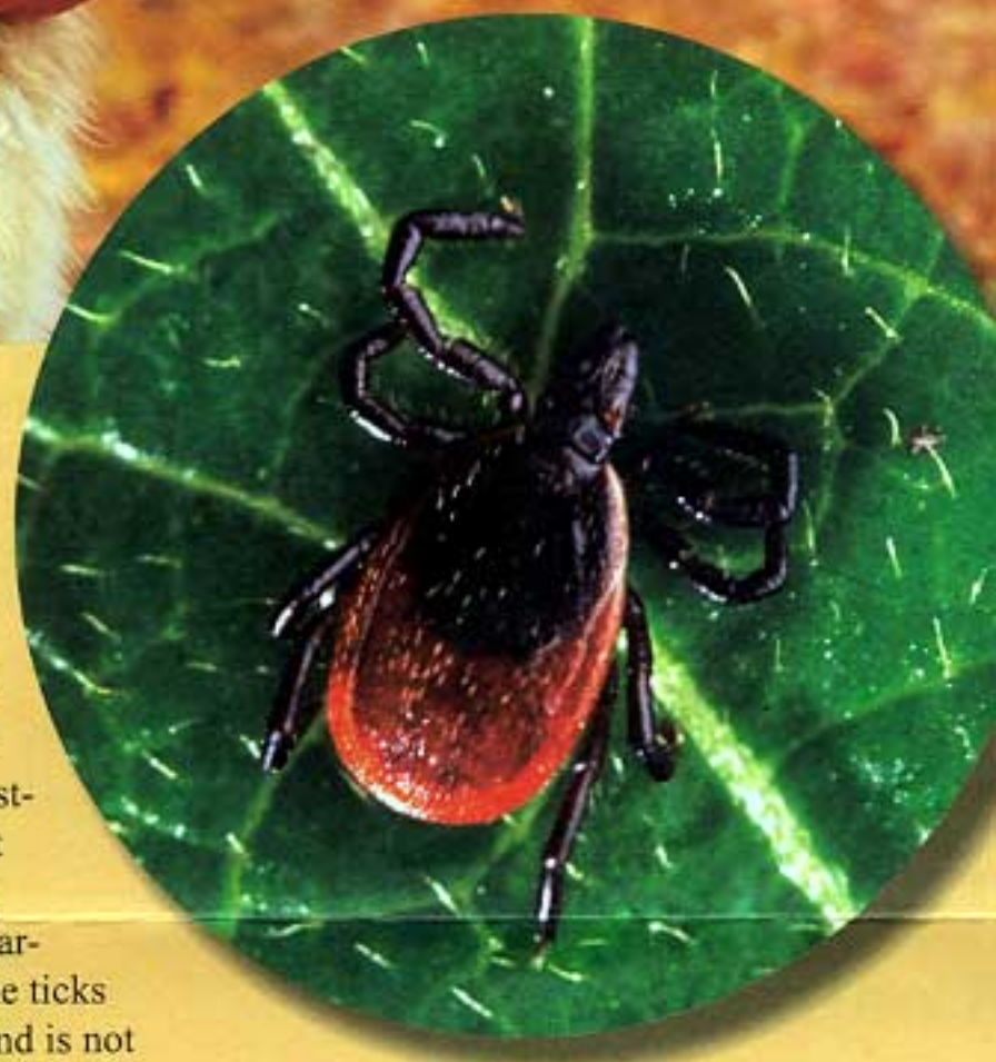
Above: Adult Deer Tick

Since many ticks are small, self examination is very important. If you visit a tick-infested area, check carefully to make sure no ticks have attached to your skin.