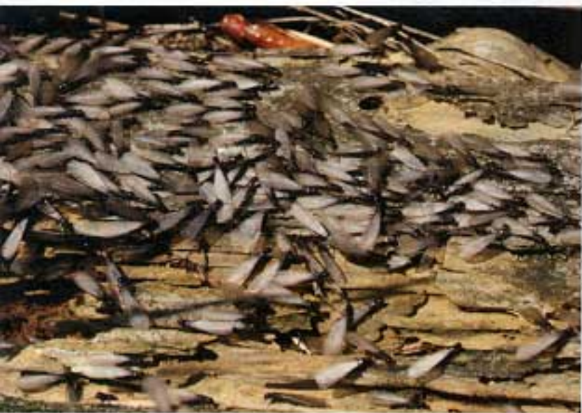
Termite swarms on a log.

If a termite infestation is found, a specialist can then design a treatment plan specific for your property that will control any current infestation and establish either a liquid treated zone, a baited zone or in some cases, both around the structure to take care of future termite infestations. ■