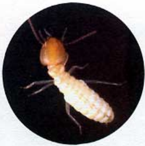
Formosan termite soldier