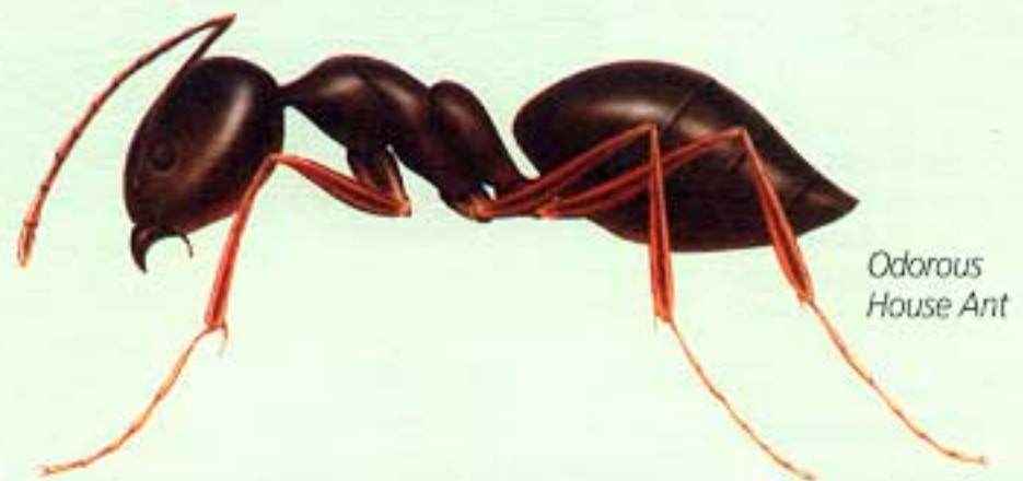
Odorous House Ant

Native and non-native ants will invade your home in the spring and summer months. They are looking for food, water and shelter. Rains often flood them out of their normal soil living spaces and so they seek higher ground — usually in your home. Or perhaps there is a drought, and they seek moisture within your home. All of these ants are very invasive, have multiple queens in their colonies and can spread throughout your home rather rapidly without a professional's intervention. The typical home invading ants you may run into include the following: Odorous house ants, Argentine ants, and Pharaoh ants.