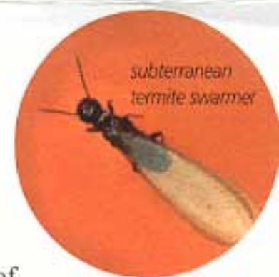
subterranean termite swarmer

Detecting and controlling termites is a job for a pest professional. A thorough inspection by a termite control specialist is the first and most